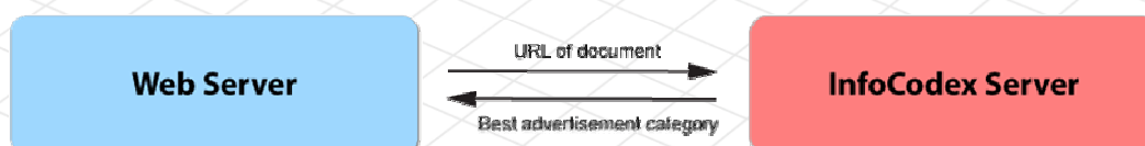
Semantic matching of currently viewed Web pages with advertisement categories in real time

In the running phase, the InfoCodex system extracts the real content from the Web page currently viewed by a user - eliminating navigation elements, select boxes, links etc. – and performs a semantic matching with the advertisement categories using a well-founded content similarity measure . For each document Infocodex returns a short list containing the most relevant advertisements and their respective relevance.